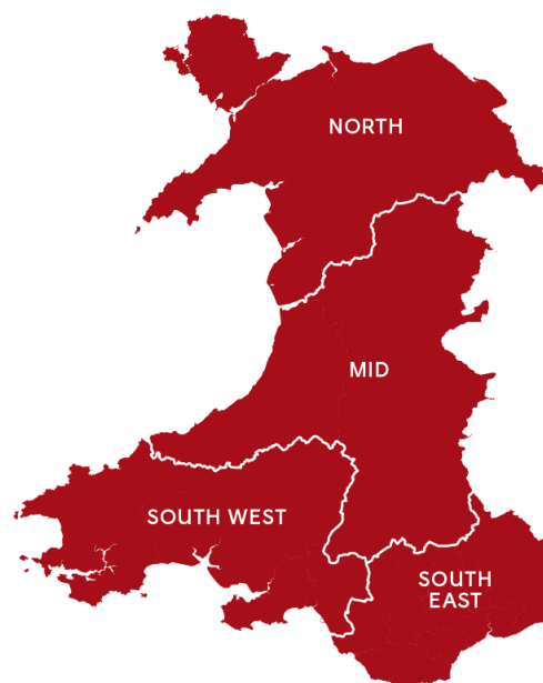
Map of regions of Wales