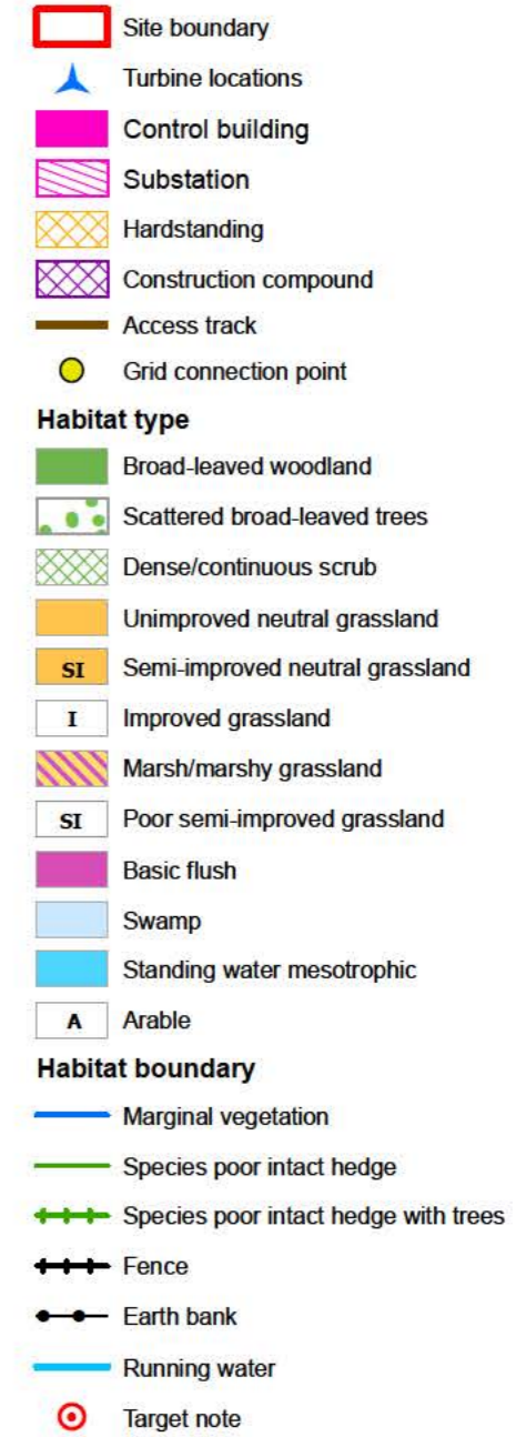
Figure 7.2 Phase 1 Habitat Survey