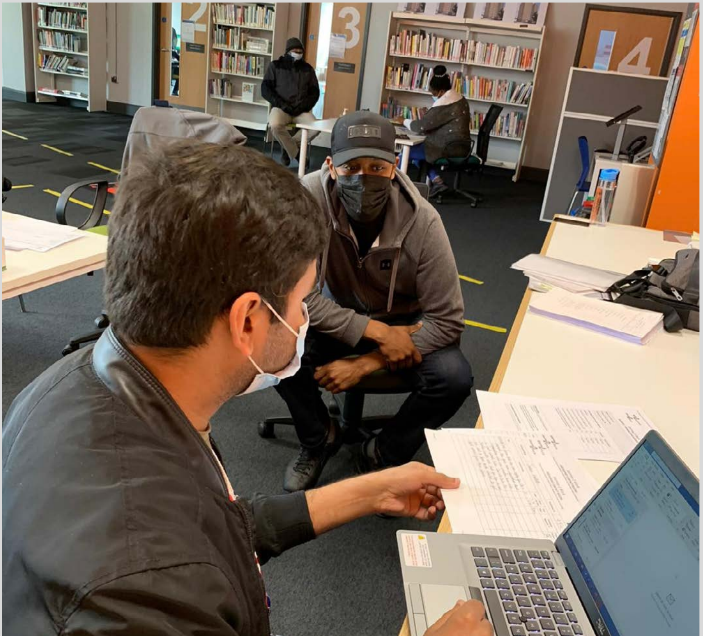
Journey2Work mentor providing 1-2-1 support