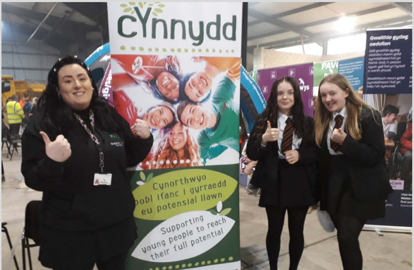
Cynnydd staff and pupils at Careers Fair