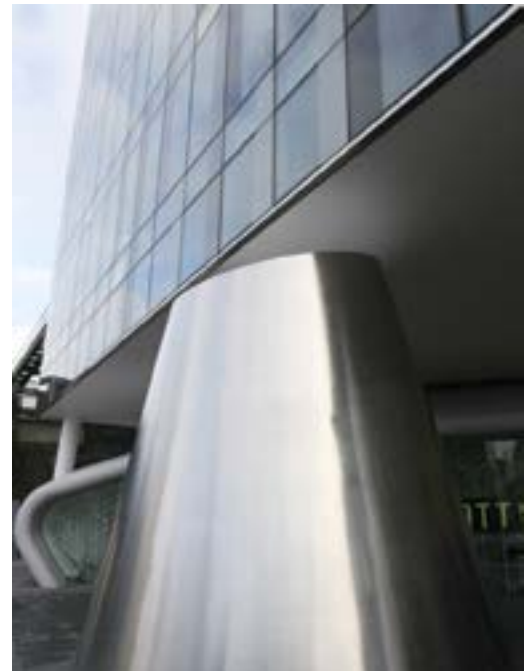
Thermal store at front of building

It has been estimated that the hydrogen fuel cell results in carbon dioxide emissions savings of 30% when compared to a building supplied by a conventional gas and electricity supply.