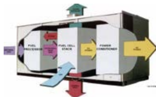
Schematic of Palestra fuel cell CHP

In the Palestra fuel cell, hydrogen is extracted from a mains natural gas supply by a steam reformer. Oxygen is sourced from an ambient air supply to the unit. The fuel cell comprises a phosphoric acid electrolyte sandwiched between two electrodes. Air and hydrogen are respectively passed over the two electrodes and energy released in a chemical reaction is converted into low-voltage DC electricity, with heat and water produced as by products. Individual cells only generate a small amount of power and so several cells are assembled into a stack to provide sufficient power for the Palestra building. Hydrogen fuel cells work continuously, providing a supply of hydrogen and oxygen fuel is maintained.