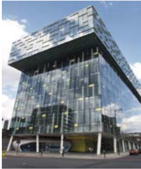
The Palestra building

The hydrogen fuel cell is the UK's largest building integrated fuel cell.