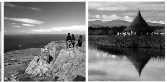
NATIONAL PARKS WALES Britain's breathing spaces

SD Bill Team Welsh Government Cathays Park Cardiff CF10 3NQ By Email: sdbill@wales.gsi.gov.uk